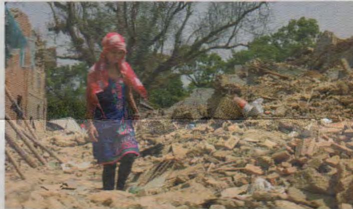
Thousands are homeless following the earthquake that struck Nepal in late April, 2015.