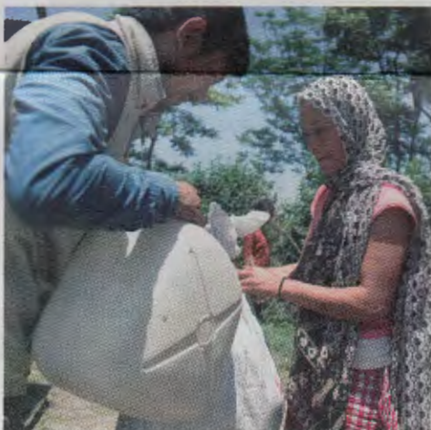
Mercy Corps delivered emergency relief to the tiny village of Kritipur, about 45 minutes from Kathmandu. Kits included a tarp, sleeping mat, blanket, soap, water purification drops and other basic items.

Your continued support can help people survive this crisis and others around the world. Just as importantly, it will help families, villages, and communities rebuild their lives and recover from tragedy. Thank you, in advance, for all you do for people in need.